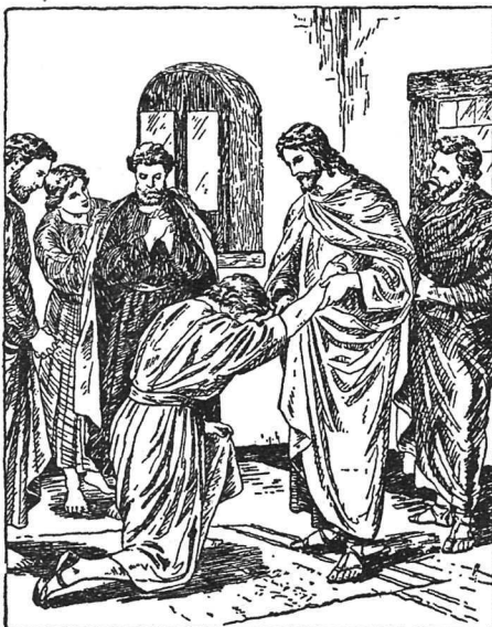
Thomas answered and said unto him, My Lord and my God.—John 20:28.

What is it that you are afraid of, my friend? Do you fear life, the present with its responsibilities? Are you afraid to face the realities of life, not even considering