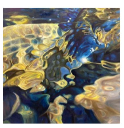
untitled Anna Cheng (Studio Art 2025)

Not the sea's fractured mirror or blasphemous waves or piquant offering that scrapes flesh and kisses the mouth but feeling scraped off sand linger on toes.