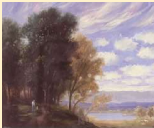
Accompanying text: Clouds of many shapes and sizes drift and dance across the sky.

Circulating Copy Call Number: Fiction L815 Cl 2000 in the Juvenile Fiction section