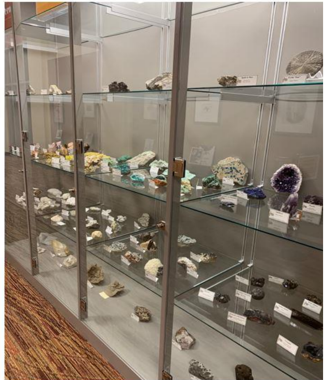
Trophy Case Display: Oakes Museum of Natural History

This is Book Award month and Murray Library is displaying some past winners of the Pulitzer, Caldecott, Newbery and Booker awards. Stop by to see if any of your favorite books were recognized.