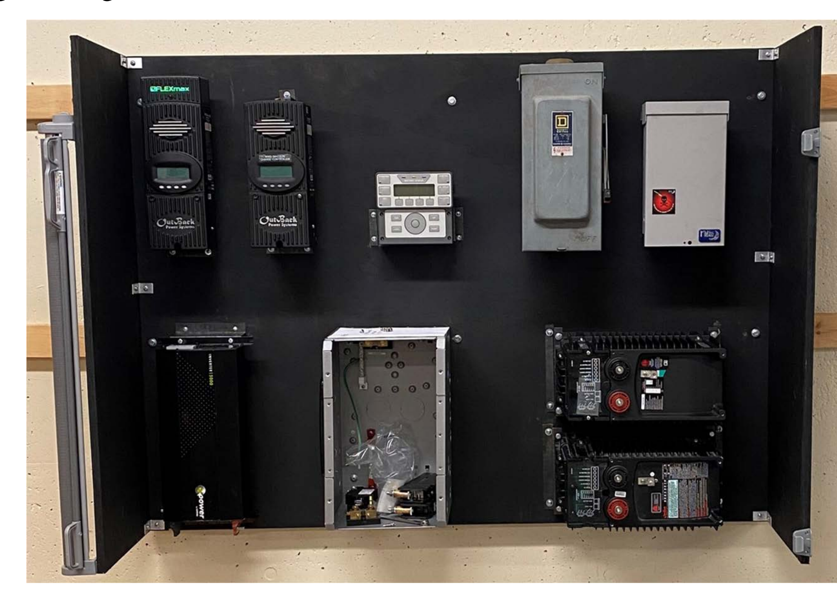
Figure 2: the Solar Lab Equipment Panel in spring 2020

Fall 2019 - Spring 2020 the major system components were selected. This is the point in a typical development cycle when the team would travel to an installation site. Work which models a site installation was begun by mounting major components to our wall unit before the semester work was cut short by Covid-19 (see figure #2). During this year we continued the work normally done on site and learned that while mounting components has the appearance of a PV system being nearly done it is really only the beginning of design execution.