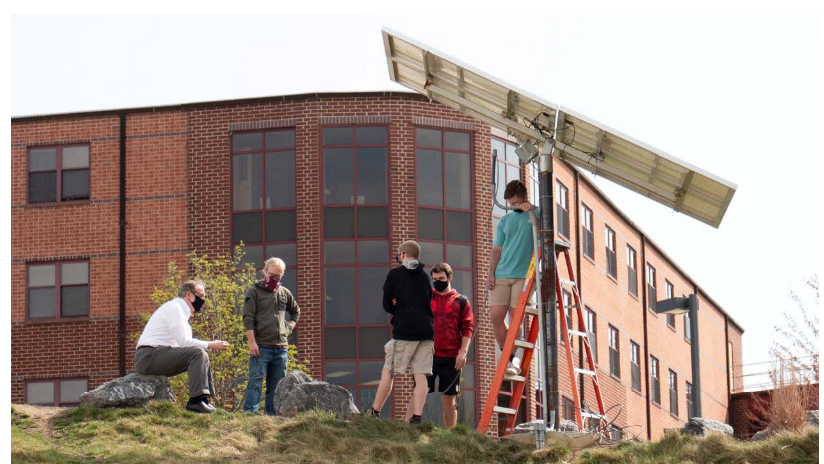
Figure 1: The Solar PV Team Spring 2021

This poster tells of how the component selection and design of a system is really only the beginning of a fully functional installation. There is much more that goes into the final build.