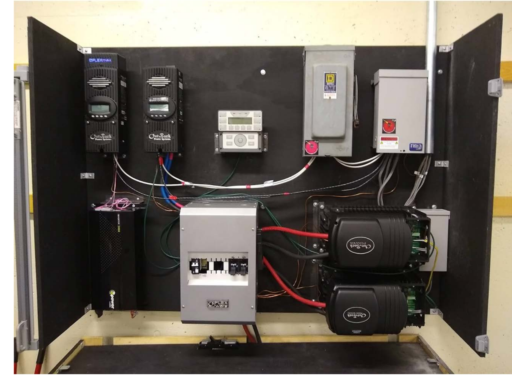
Figure 3: the Solar Lab Equipment Panel wired in spring 2021