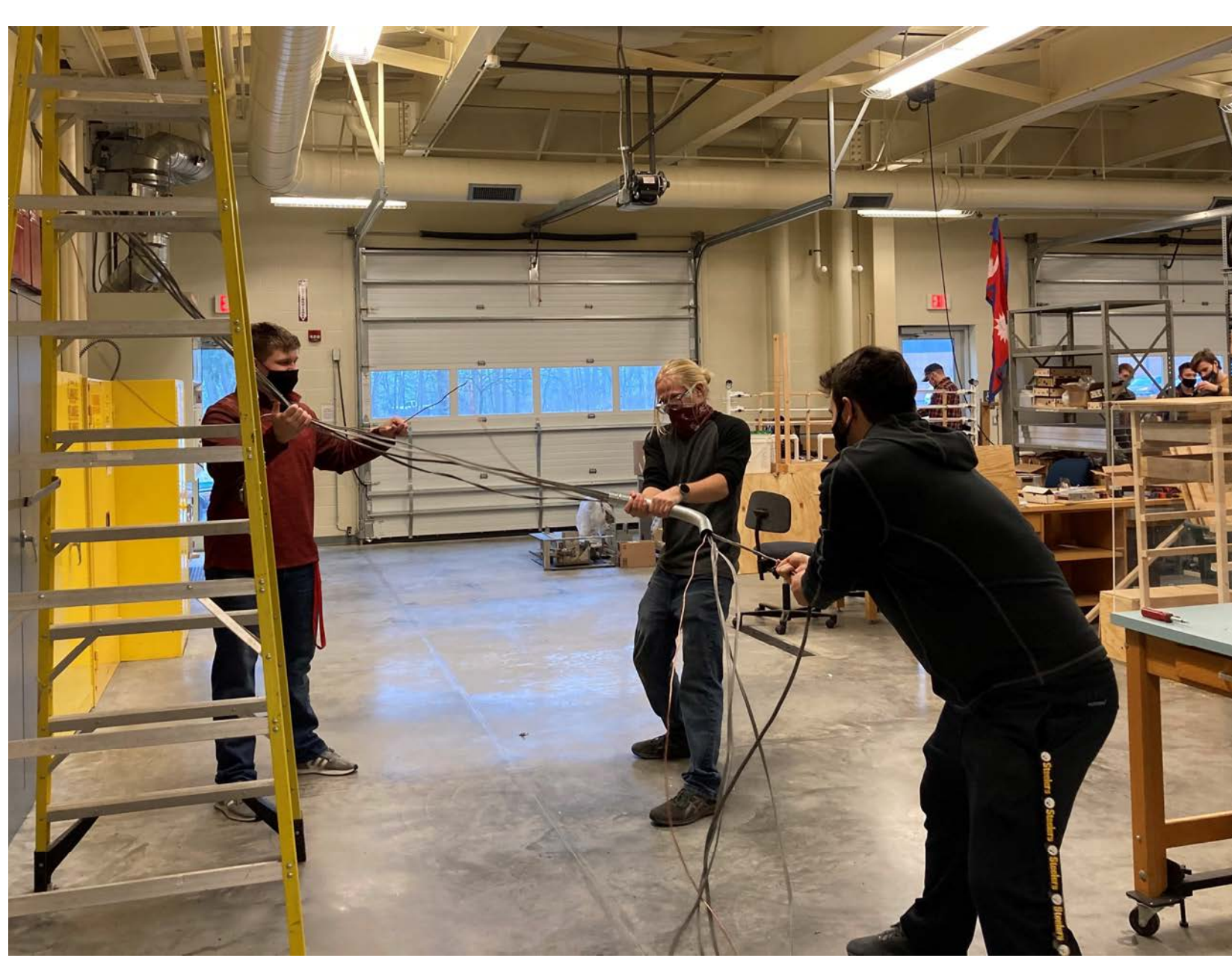
Figure 4: Pulling wire through conduit

eling to an installation site, a team does not have access to the actual system components since they are bought in country. Thus the Mate programming that we performed during this semester is typically done as a part of the final installation.