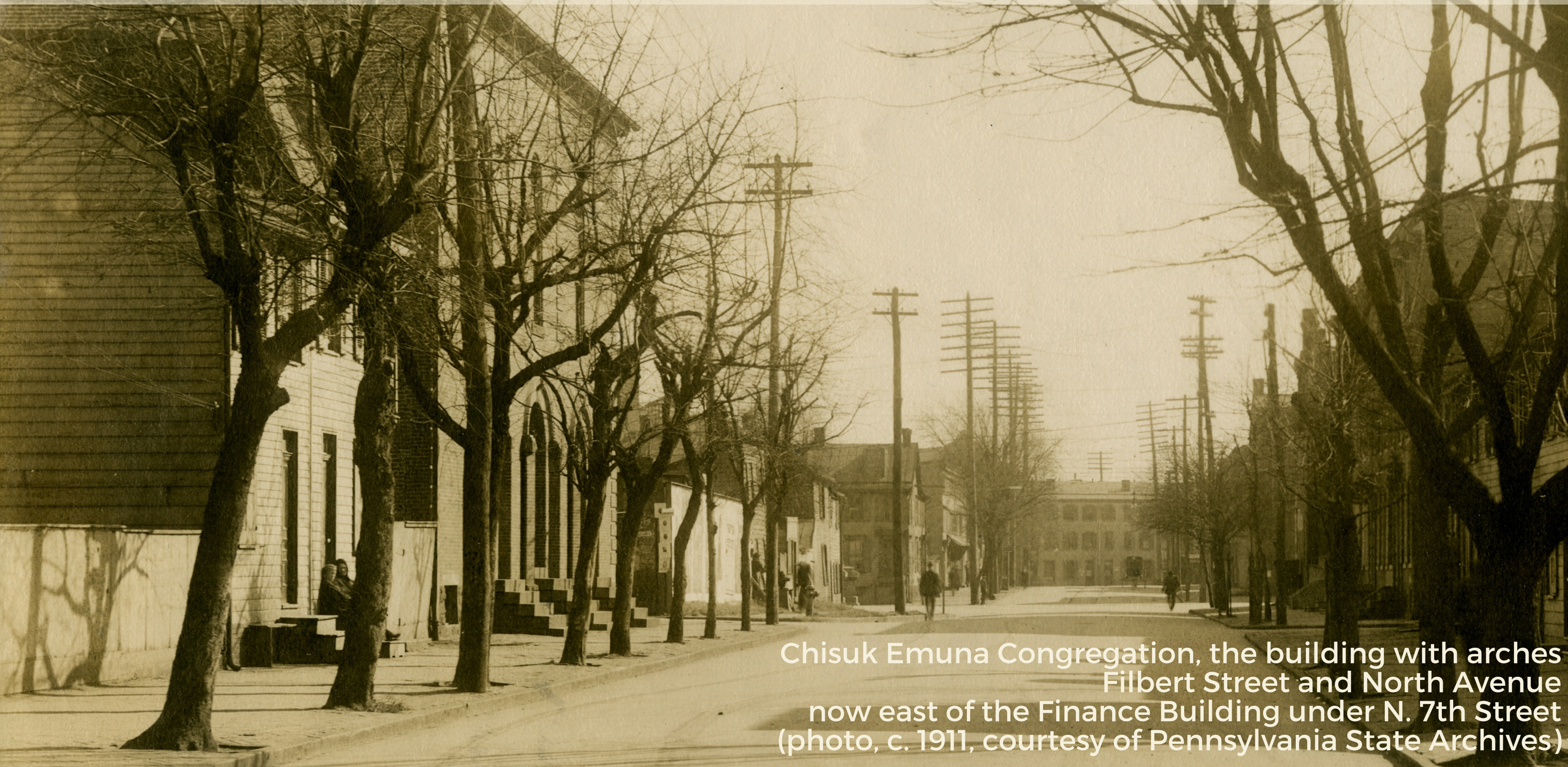
Chisuk Emuna Congregation, the building with arches Filbert Street and North Avenue now east of the Finance Building under N. 7th Street (photo, c. 1911)