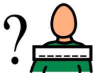
What's your name?